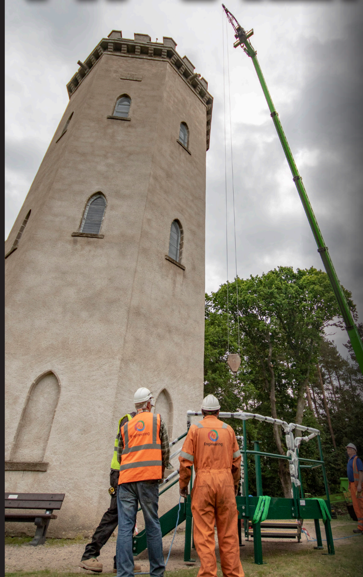
The mobile crane was small enough to navigate the narrow pathway up to the tower, and tall enough to lift the platform over the parapet.