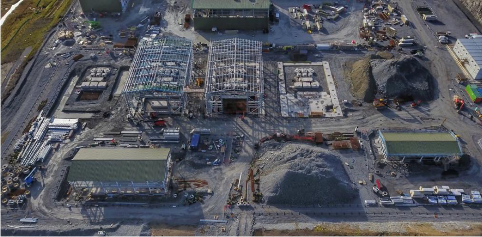
Aerial picture of the site and buildings that AJE have been involved in

AJE is currently working on a project which spans an area the size of around 40 football pitches.