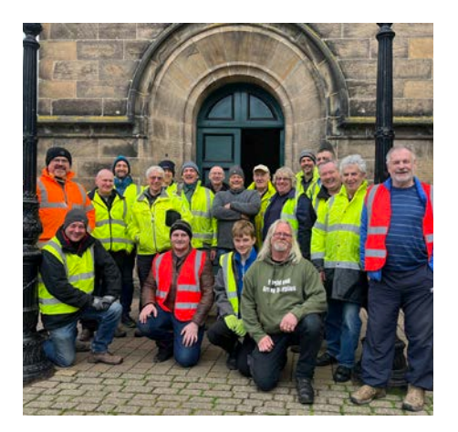
Volunteers were out in force to erect the town's Christmas lights

Twenty volunteers descended on the High Street to ensure the lights were put up safely in time for the big switch on which will take place on December 3rd at 5pm.