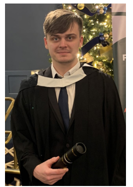
Current and past apprentices at AJE