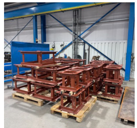
Fabricated foundation supports ready for installation