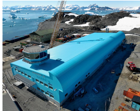
The new Discovery Building in Rothera is almost complete

the whole station, an operations tower, medical centre, improved training facilities including a climbing wall for expedition teams and an education centre. It will also house enhanced wellbeing areas including gym, breakout areas, music centre and arts and crafts facility and backup systems for life support and operations.